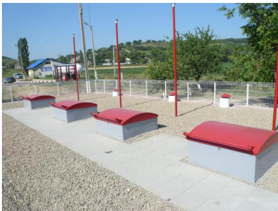
Mounting technology at petrol filling station

Nowadays this system successfully operates at petrol filling stations as a brand of "Lukoil Moldova", "Rompetrol", "Petrom Moldova", "Tirex Petrol".