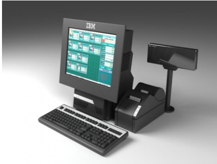
The service of POS

tanks. The tank cleaning is only made by the staff specialists of LLC "Combuserice", the right to tank cleaning is not assigned to external organizations or other persons. We apply a specialized equipment for tank cleaning.